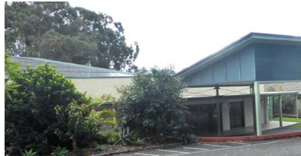
Bracken Ridge Baptist Church